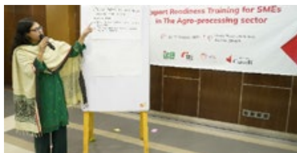
Training participants in Bangladesh - October 2022

During October 2022, gender-responsive training on export readiness was delivered to an additional 62 Bangladeshi SMEs (40 women-led) from the processed food sector. It also included technical training on Gender Equality and Social Inclusion (GESI), digital marketing, Corporate Social Responsibility (CSR) and climate-smart business practices.