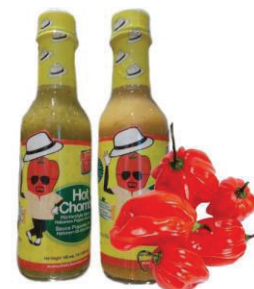
hotCHOMBO true hot sauce, Panama