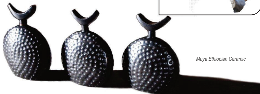
Muya Ethiopian Ceramic