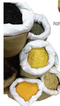
PT Coco Sugar Indonesia